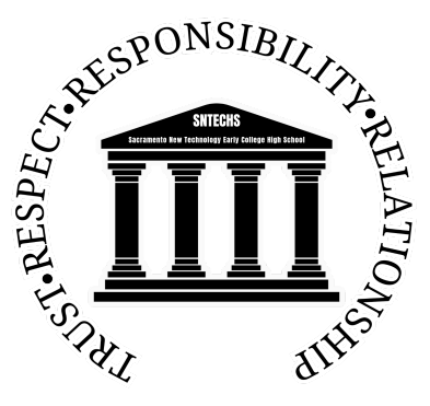
THE 4 PILLARS OF CULTURE, CHARACTER & COMMUNITY

Building positive relationships in high school is essential as it fosters emotional support, enhances academic success, develops social skills, improves mental health, and prepares students for future personal and professional interactions.